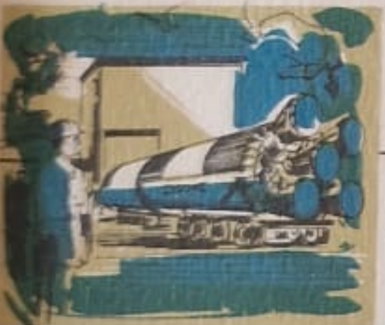
NASA-Michoud Assembly Facility