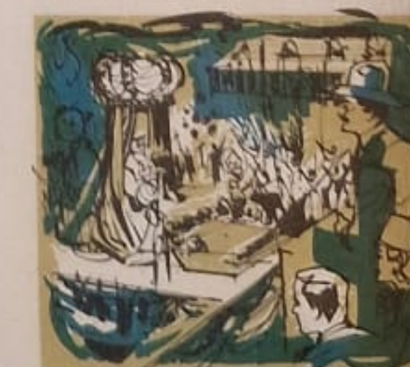
The Mardi Gras