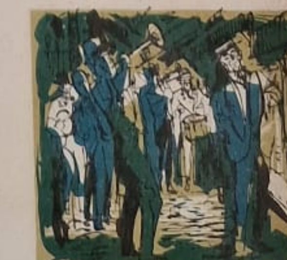
The Birthplace of Jazz