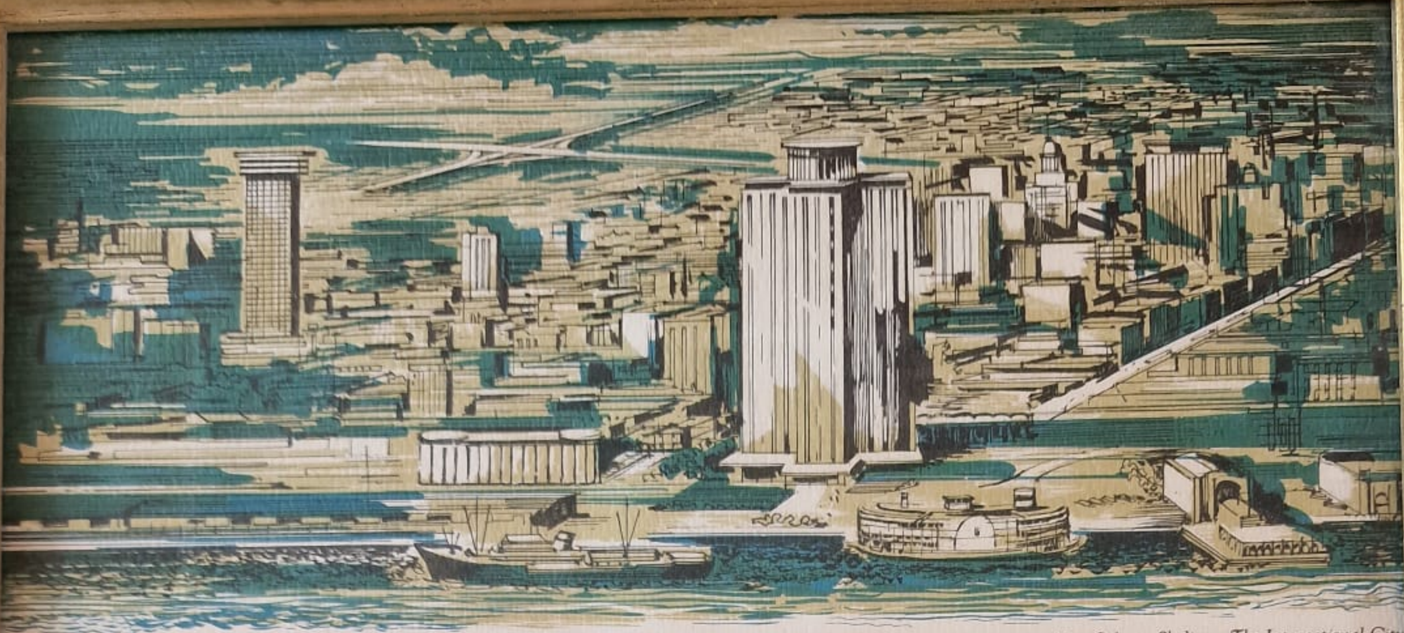
New Orleans Skyline—The International City