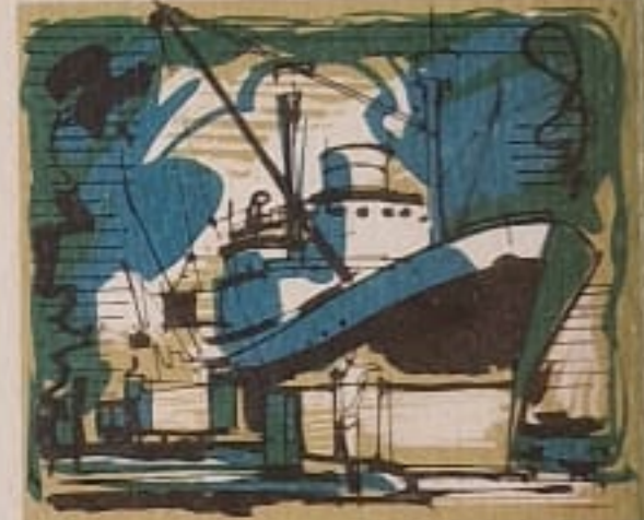
The Nation's Second Port