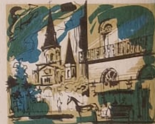
Romantic Vieux Carré