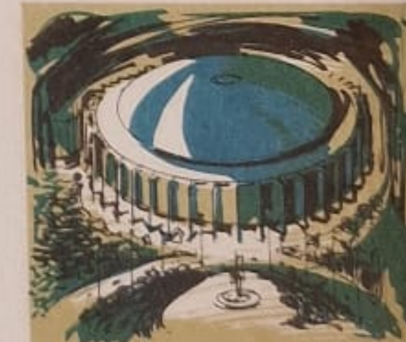
Big League Sports City