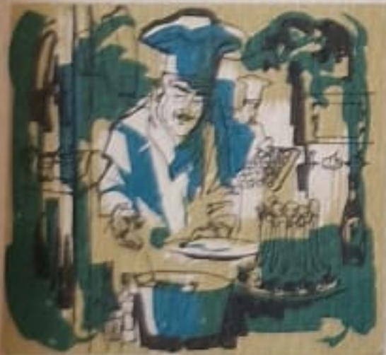
World Famous Cuisine